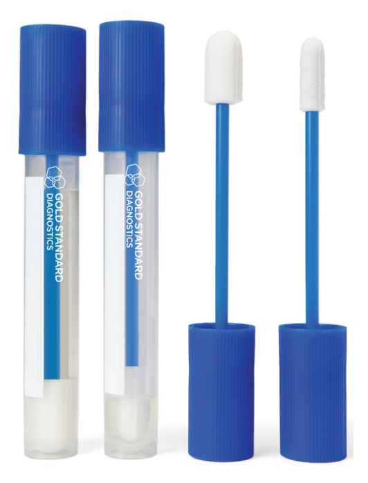
PUR-Blue<sup>™</sup> Swab Sampler