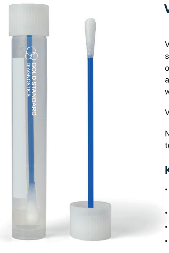
Variswab<sup>™</sup> Swab Sampler